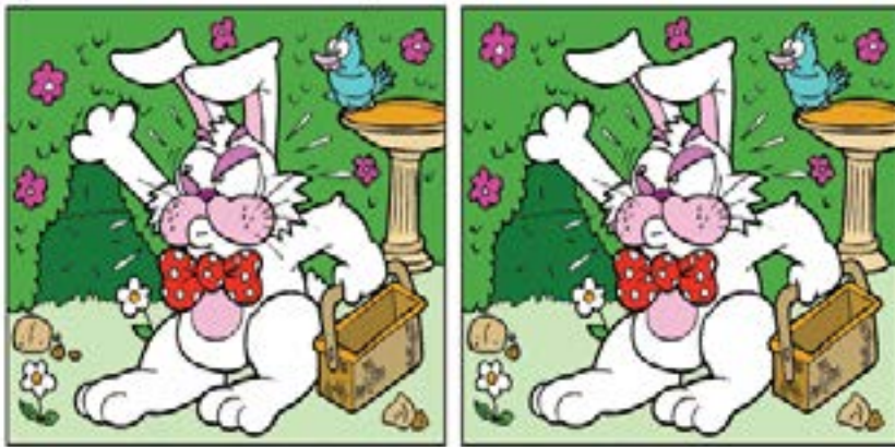
EVERY YEAR IT'S THE SAME. SOME ONE STEALS MY EGG COLLECTION!